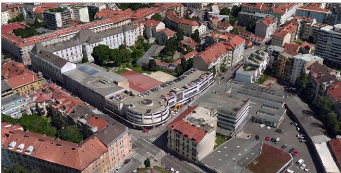
Enjoy advanced level-of-detail technology to ensure smooth navigation on city-scale scenes.