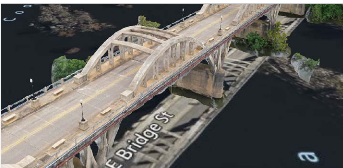
Review reality meshes in a web environment for visual checks.