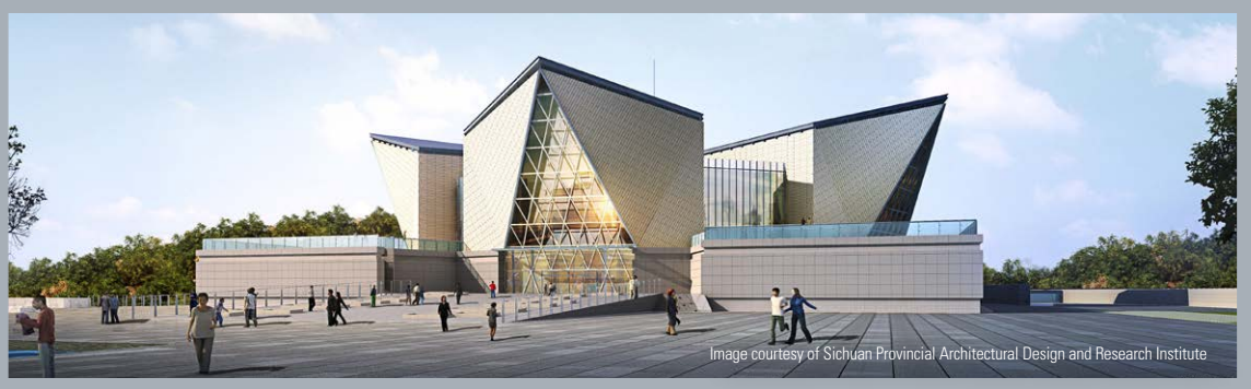
Image courtesy of Sichuan Provincial Architectural Design and Research Institute