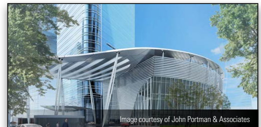
OpenBuildings Designer was used on this mixed-use office and hotel with boutique retail.

For additional information, and to read about the extraordinary projects designed using OpenBuildings Designer, visit https://www.bentley.com/openbuildings-designer/