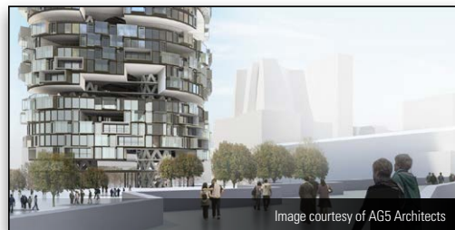
OpenBuildings Designer was used to design this multi-use residential tower.